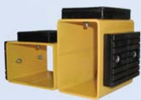
4 two position adapter blocks included Part#: SR10-001