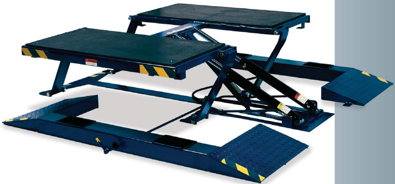
Model#: SRM7 7,000 lb. capacity Short-Rise Lift