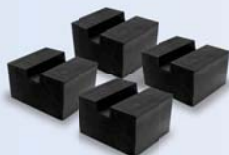
Four 4 1/8" spotting block auxiliary adapters included Part#: 63100

For more information, contact your Authorized Challenger Lifts Distributor: